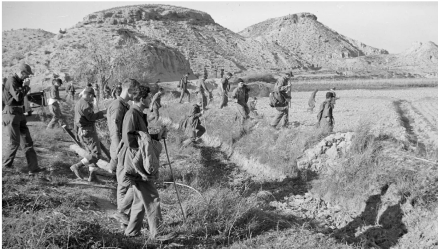
The lost bombs at Palomares scattered seven pounds (3.2kg) of plutonium into the wild